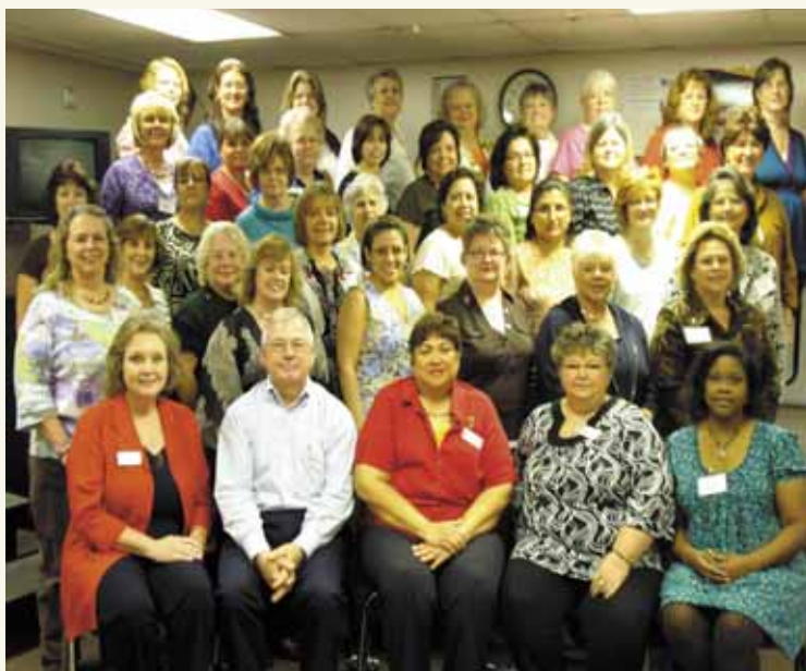
All participants of Consultant Training.

The consultant training was held in Leander ISD at Cypress Elementary School in Cedar Park, Texas. Consultant training was an exciting weekend of training and fellowship.