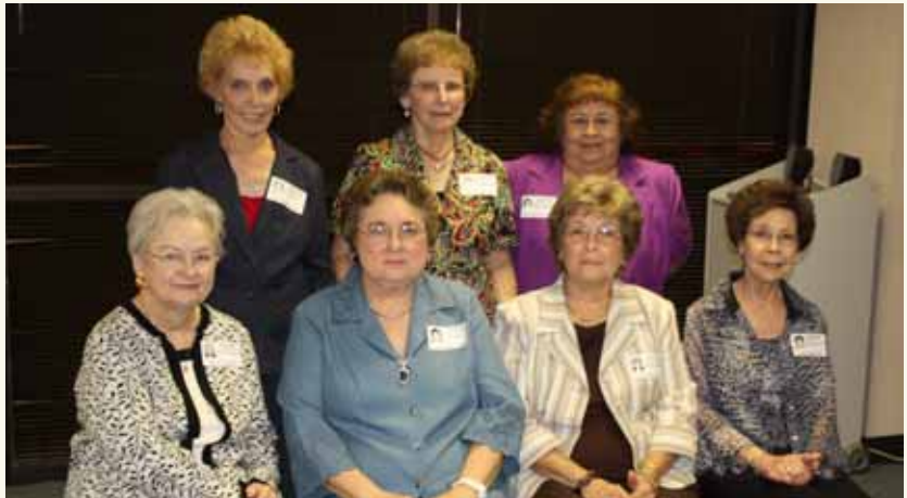
Lamar Consolidated Educational Secretaries Association Charter Members

The Lamar Consolidated Educational Secretaries Association (LCESA) recently celebrated 30 years of serving Lamar CISD and its community. Past Superintendents and Charter and Retired members, as well as current members and administrators, were on hand to recognize this significant accomplishment. With a PowerPoint presentation of images from these years playing on an overhead screen, squeals of laughter and hugs