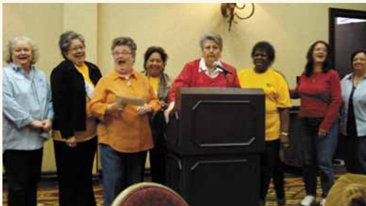
Past Presidents presented a check to the FWC. It was their way to continue to support TESA. It was a wonderful surprise!