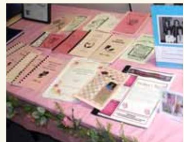
Lamar Consolidated Educational Secretaries Association Archives Displayed