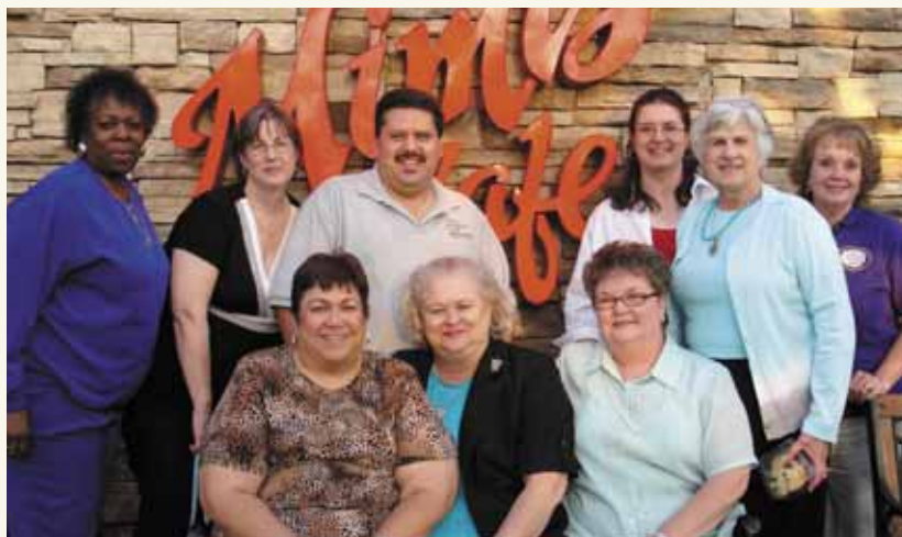
Part of the Texas Delegation enjoyed a dinner out. Looks like a very happy group.