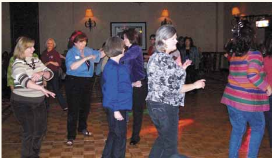
Conference attendees do enjoy their dancing.