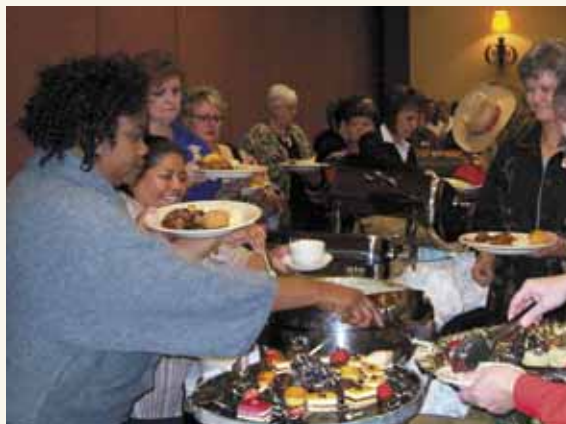
FWC participants enjoy the barbeque buffet.