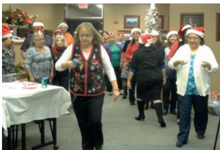
December 14, 2017: Members playing games at the Meeting/Social.