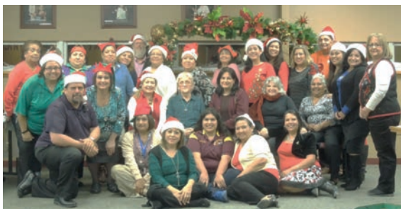
December 14, 2017: VESA members present at the December Meeting/Social.