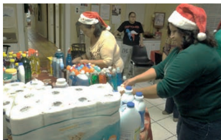
VESA members sorting the items to make it easier to put away.