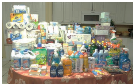
All donations sorted by category.