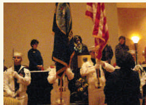
Presentation of our colors by the Naval Intelligence Operations Command.