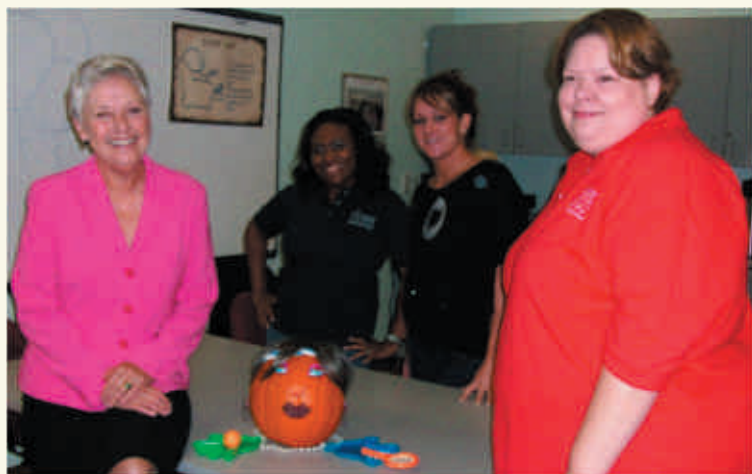
"Most Original" It was great fun!