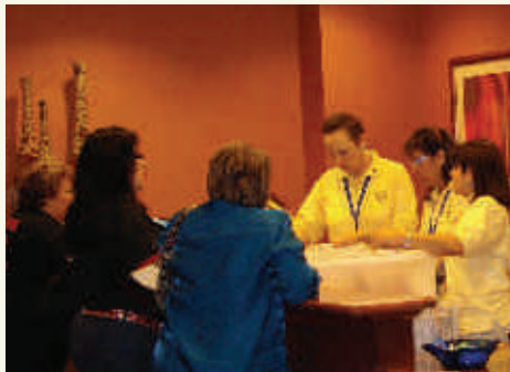
TESA Fall Work Conference Registration in Action!