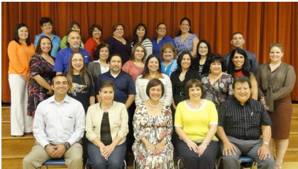
VESA Bosses present at the 46th Annual Bosses Banquet