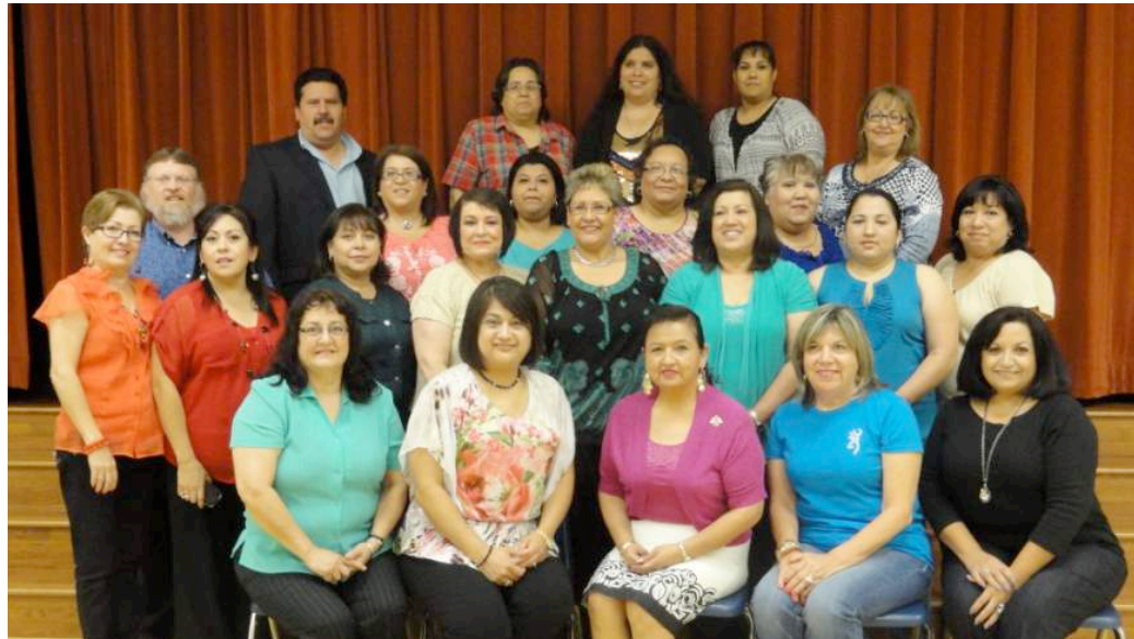
VESA Members present at the 46th Annual Bosses Banquet