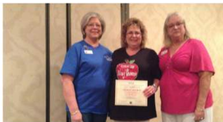
Award Winners at SWC 2013

Never say never, for if you live long enough, chances are you will not be able to abide by its restrictions. Never is a long, undependable time, and life is too full of rich possibilities to have restrictions placed upon it.