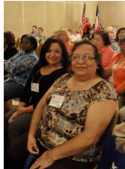
VESA Members attending TESA SWC 2013