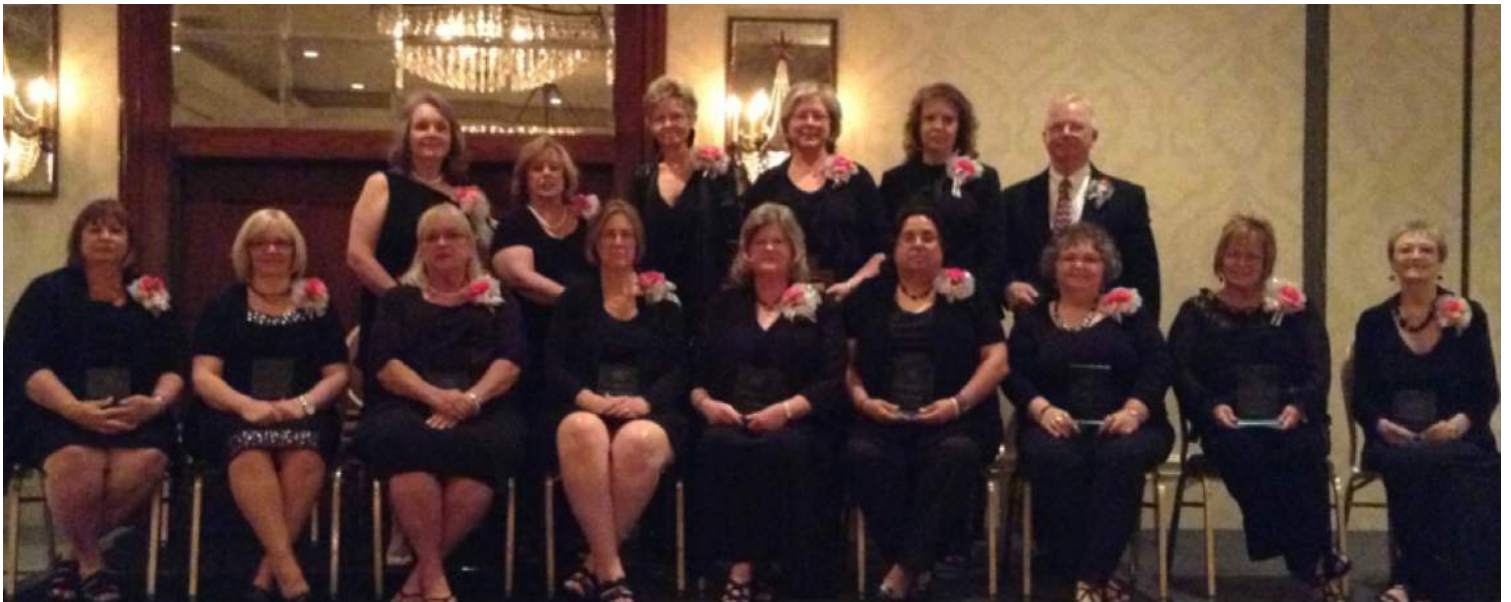
TESA 2013-2014 Executive Board