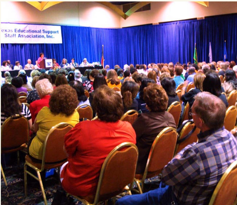
Wow! A full house