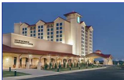
Embassy Suites San Marcos