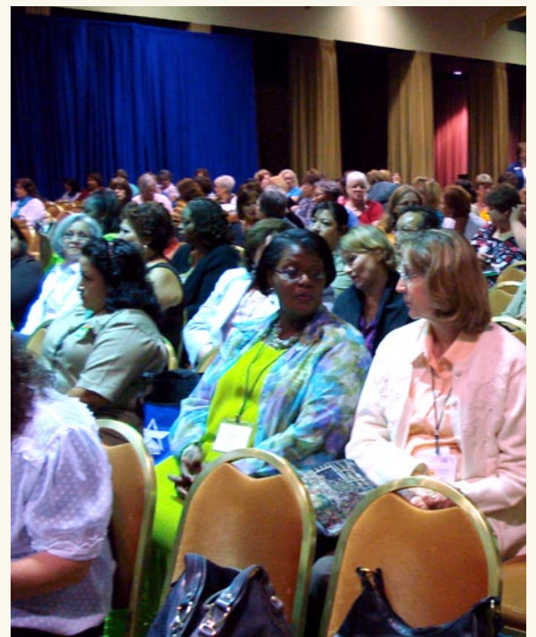
Were you there?