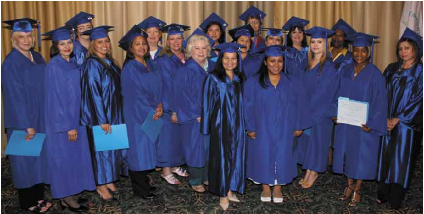
Pictured are some of the Summer Work Conference CEOP Graduates.