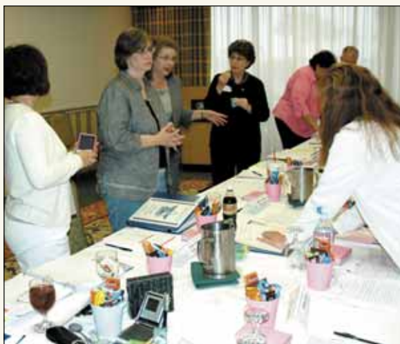
Executive Board members continue discussing issues while on break. What dedication!