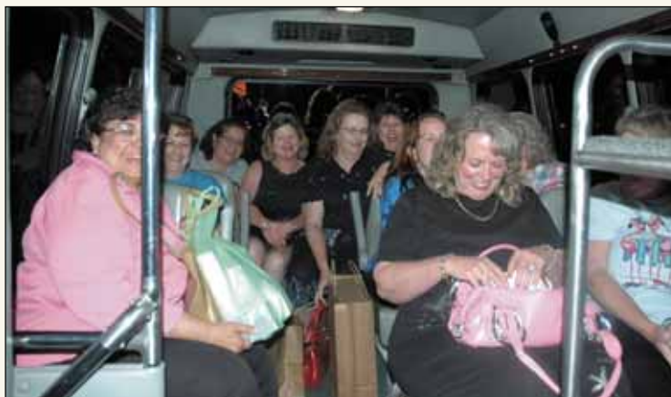
Board members find time for some fun and relaxation after a lengthy day of business!