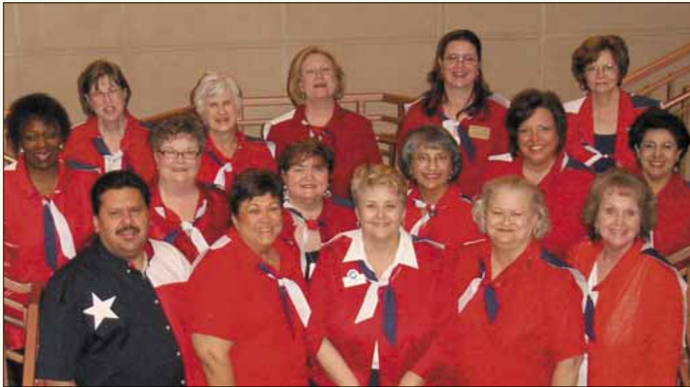
The Texas delegation proudly posed for a group photo.

Doing it "Texas" style in Colorado! A large delegation from Texas, mainly TESA members, attended the NAEOP Annual Conference held in Broomfield, Colorado. The "stars" were definitely shining on Texas as TESA once again received outstanding recognition in the various awards categories sponsored by NAEOP.