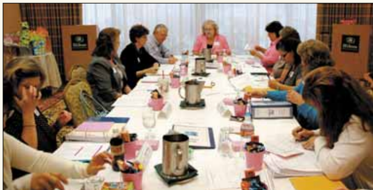
Executive Board in session.

Members of the TESA Executive Board traveled to Galveston to attend the 2008 TESA Spring Executive Board Meeting. Friday, April 25, was designated as a day of travel and social interaction. Saturday, April 26, Executive Board members began early and spent an intense day reviewing, discussing, and making decisions regarding the business aspects of TESA. The Executive Board worked together as a team to render decisions that they felt would be in the best interest of TESA and its members. Sunday, April 27, Executive Board members traveled home after a very rewarding and productive weekend.